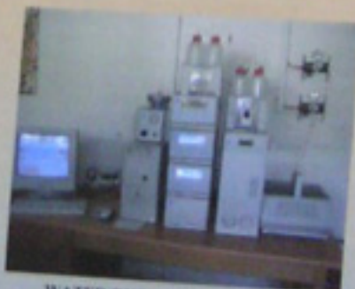
WATER QUALITY ANALYSES