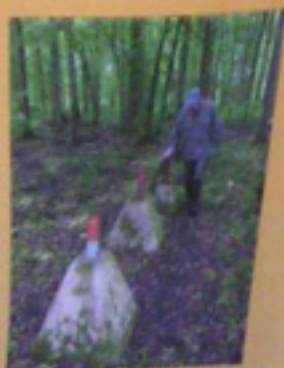
GROUND LEVEL WATER MONITORING