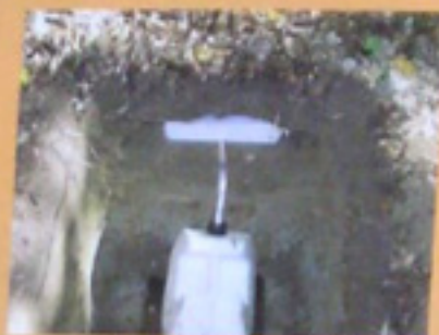
SOIL SOLUTION MONITORING