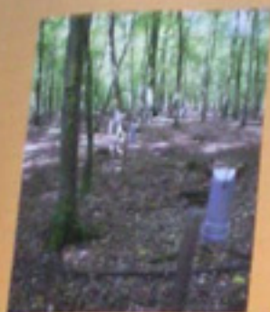
BENCHED OAK AND COMMON HORNBEAM FOREST COMMUNITY