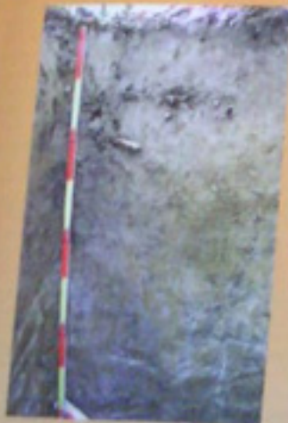
DYSTRIC, GLEYIC PLANOSOL